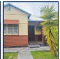
33 WALTER STREET NANNUP

Offering you the finest experience in real estate.