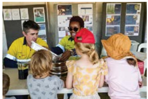
Above: Pictures from the Talison Marquee at the 2023 Bridgetown Agricultural Show