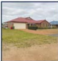
7 KINCAID CLOSE BRIDGETOWN