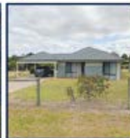
4 ABERDEEN AVENUE BRIDGETOWN