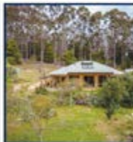
122 HENDERSON ROAD KANGAROO GULLY