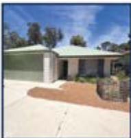
1 PENINSULA ROAD BRIDGETOWN