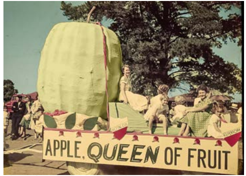
The apple queen float at the Bridgetown festival, April 7, 1958.