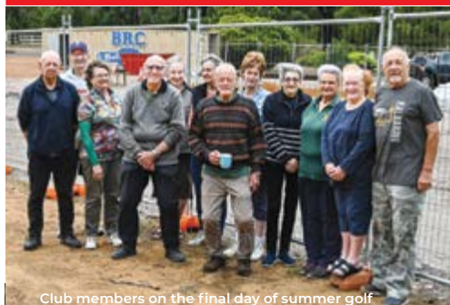
Club members on the final day of summer golf