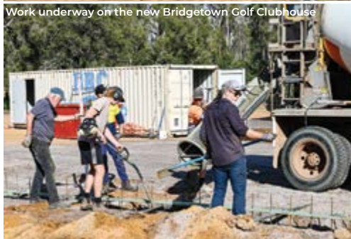
Work underway on the new Bridgetown Golf Clubhouse