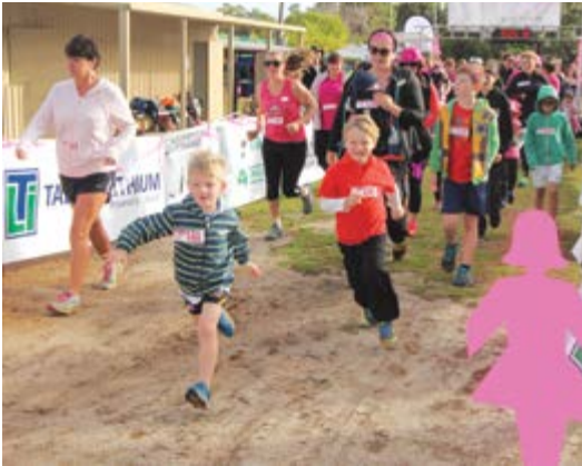
Memories of Events Past

For further information contact the Community Team at Talison on GBContact@talisonlithium.com