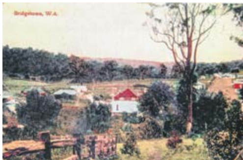
Bridgetown in 1890 Steere Street on the right, a gravel road

The Perth visitors "expressed appreciation of the Societys exhibition, and wished every success to an institution, which in their opinion takes second place only to the Royal Agricultural Society of the whole colony.