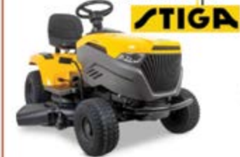
Stiga Tornado ST 500, 452 cc 15hp engine, 38" cut, 7 cutting levels plus mulch kit