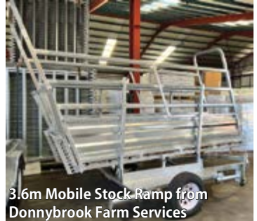
3.6m Mobile Stock Ramp from Donnybrook Farm Services

To assist participants making purchases EFTPOS facilities will be available on the night.