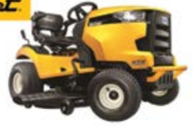
Cub Cadet XT2 LX 42, 679 cc V-twin EFI engine, 42" cut, 12 cutting levels

12 ROSE STREET BRIDGETOWN Call PETER or CHRIS on 9761 4725