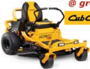
Cub Cadet ZT1 Ultima Zero Turn. 22hp Kohler KT7000 twin cylinder engine 46" cut